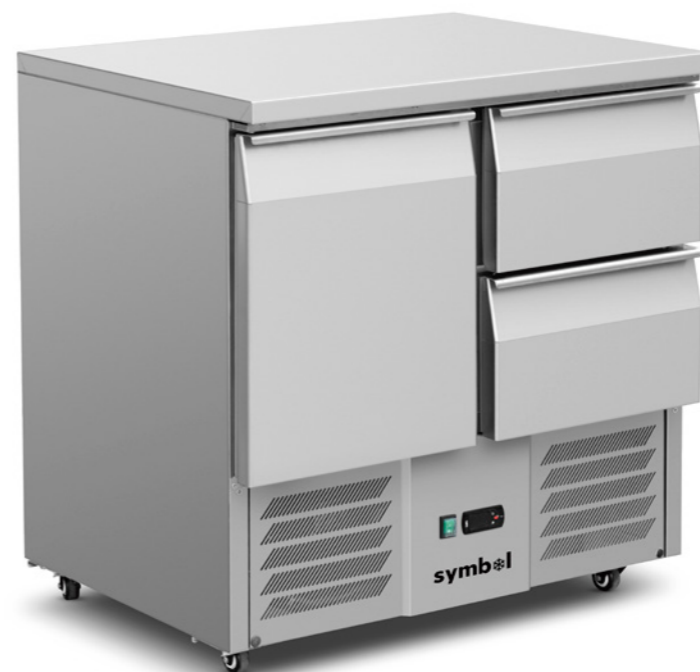
S901 S/S Top 2 × GN1/2

* 我司有权利更改产品设计和配置，不会提前告知客户！ We have the right to change the product design and configuration without informing customers in advance!