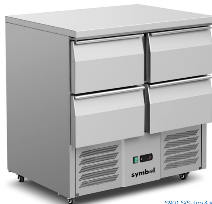
S901 S/S Top 4 × GN1/2